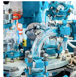
Ohio Chemical Manufacturing Plant Fire