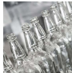
Owens-Illinois Glass Manufacturing